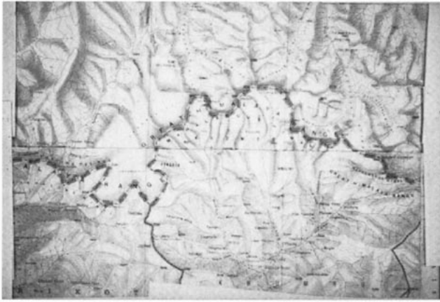
Fig. 1. Map of Everest and surrounding area.

glacier and noticed that whenever a narrow 6-inch-wide crevasse was crossed there seemed to be claw marks in the snow at the end of the toe imprints. Finally we left the glacier and the line of footprints and got onto an increasingly grassy lateral moraine. We followed this for an hour or two, passing many wild goats until we found a suitable campsite. From here we carried out an extensive exploration of the Menlung Basin and identified a peak higher than Gaurisankar, which we called Menlungtse ( Tse means a peak). Two days later we were joined by Murray and Bourdillon, who, after visiting the Nangpa La, a 20 000-foot glacier pass between Nepal and Tibet used throughout the year except for the winter months, had followed our route into the Menlung Basin. All tracks had been deformed by the sun and wind.