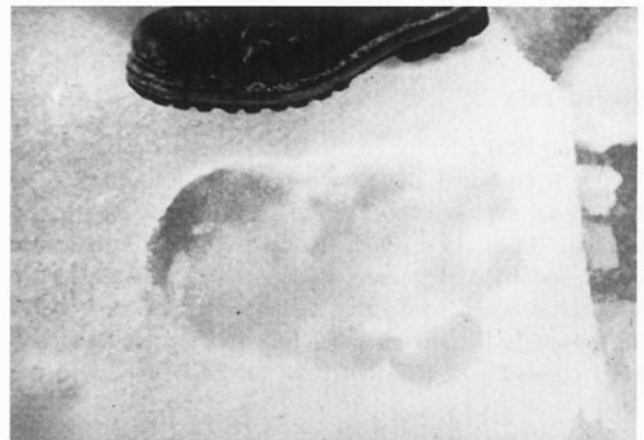
Fig. 2. Footprint with boot for comparison.

The discovery of these tracks in 1951 stimulated great interest in the Yeti, and there have been many expeditions of varying competence in the Himalaya and central Asia. None has been successful in that no skeleton, carcass, bones, hide, or feces have been found [6–8]. Inevitably because of these negative findings it has been suggested that the footprints that Shipton and I found in the Menlung Basin were a hoax [9], and it is implied that Shipton wrote the account as he was bitter following his dismissal from the leadership of the 1953 expedition. This ignores the fact that his description of