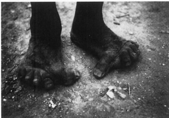
Fig. 5. Deformed toes.

The claw marks we observed in the Menlung could be explained by the presence of onychogryphosis or ramshorn nail. Although commoner in the big toe when the deformed nail may curve around and puncture the skin of the flexor aspect, it can occur in any of the toenails, and some deformed nails stick out like claws. This is probably the result of recurrent minor trauma and infection in unhygienic conditions. Treatment is by removal under anesthetic—a facility not available in remote Himalayan valleys. Also, the